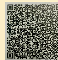
Payment Code (Scan & Pay)