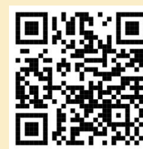
Location QR Code