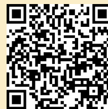
Registration QR Code

Registration Link: https://forms.gle/eAGJwXK54ByhGek48